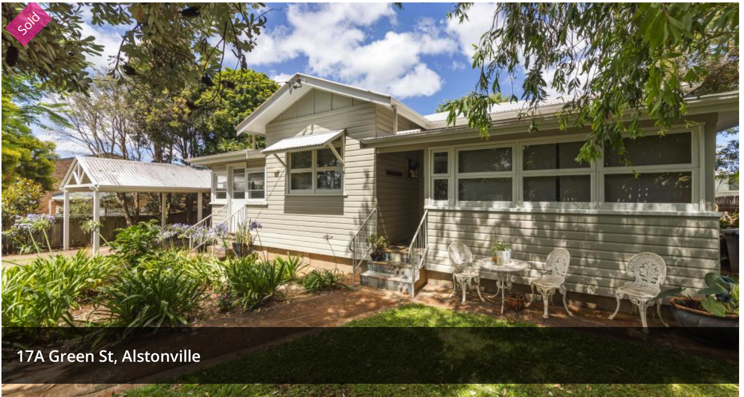
17A Green St, Alstonville