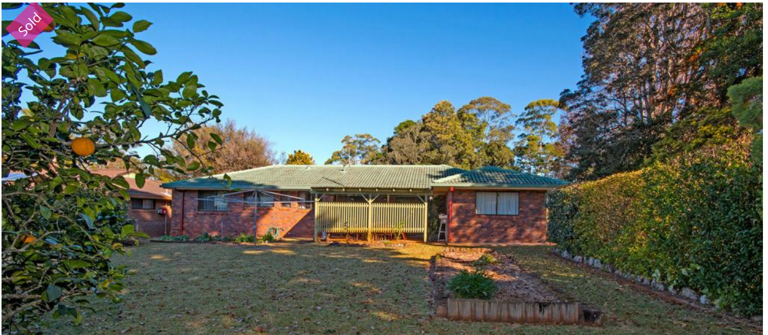
35 Mellis Circuit, Alstonville