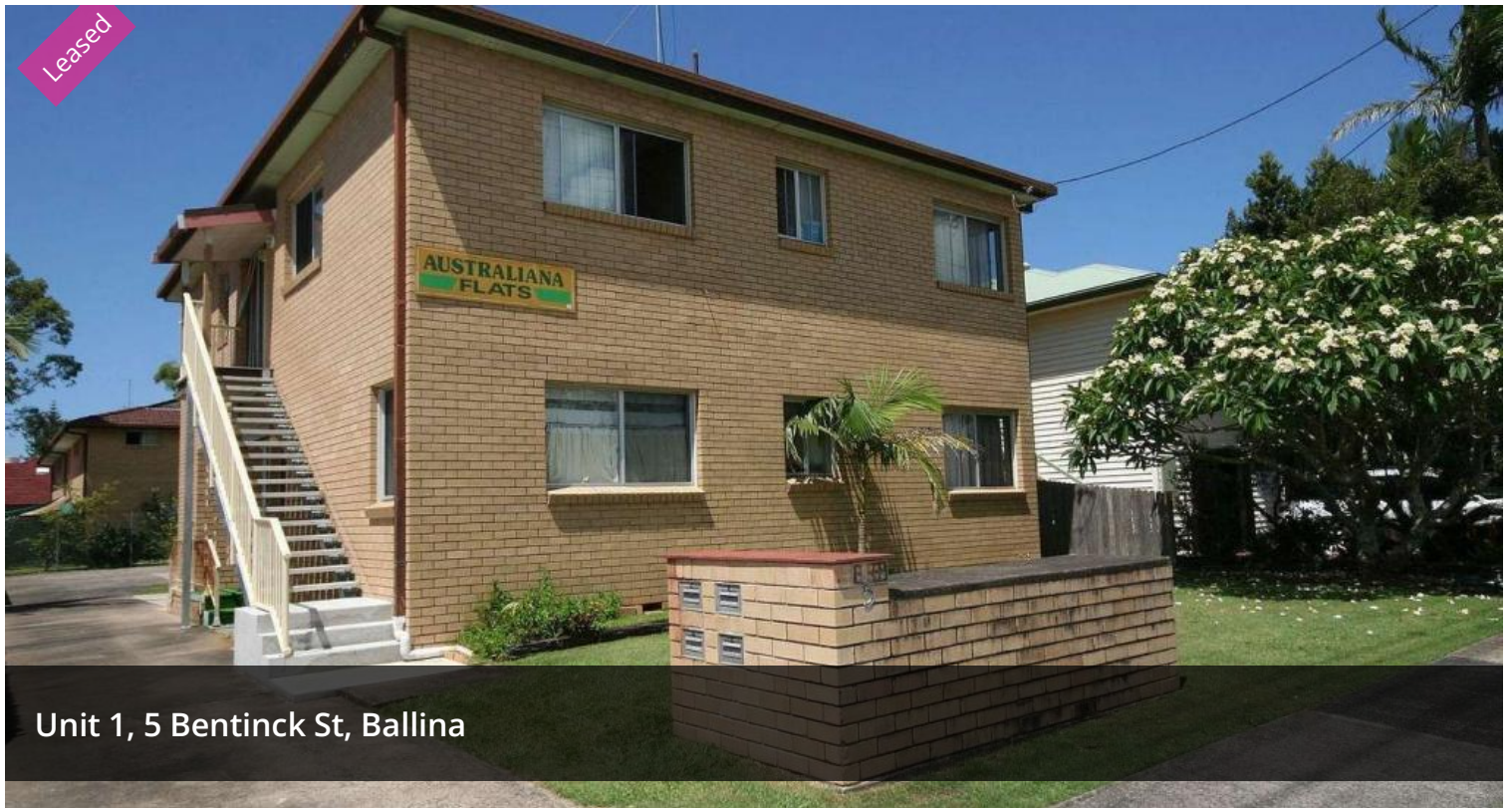
Unit 1, 5 Bentinck St, Ballina