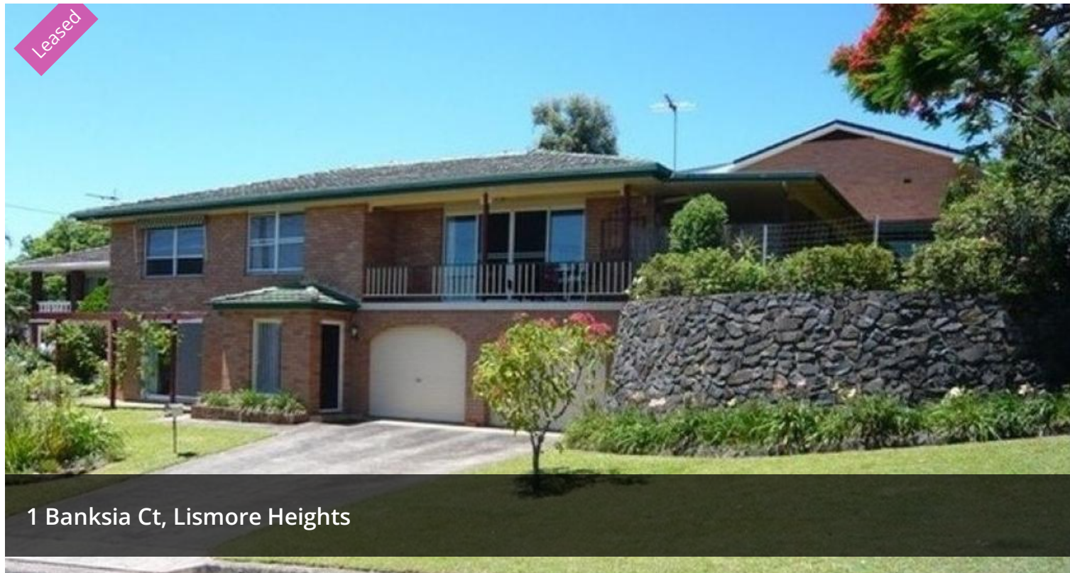
1 Banksia Ct, Lismore Heights