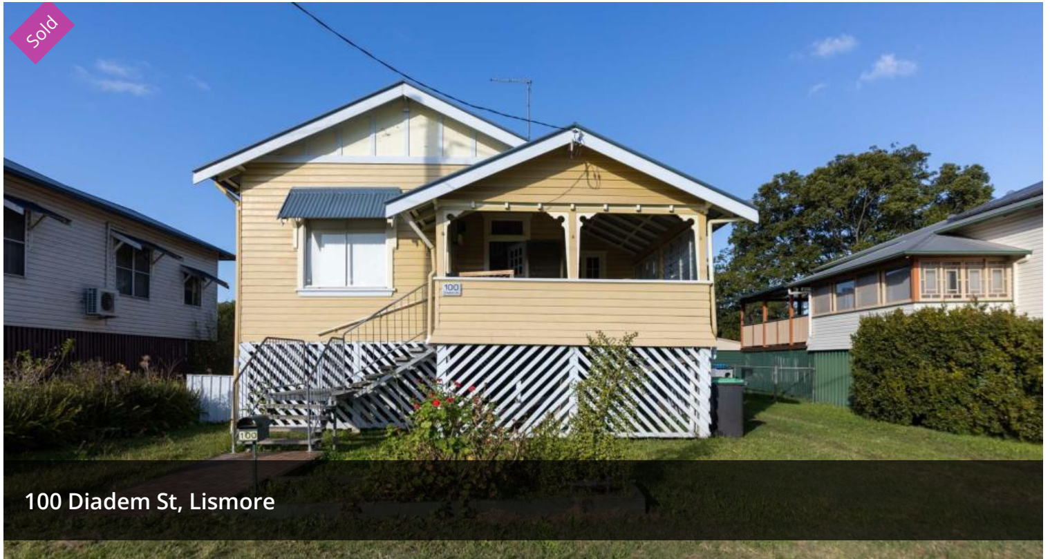
100 Diadem St, Lismore