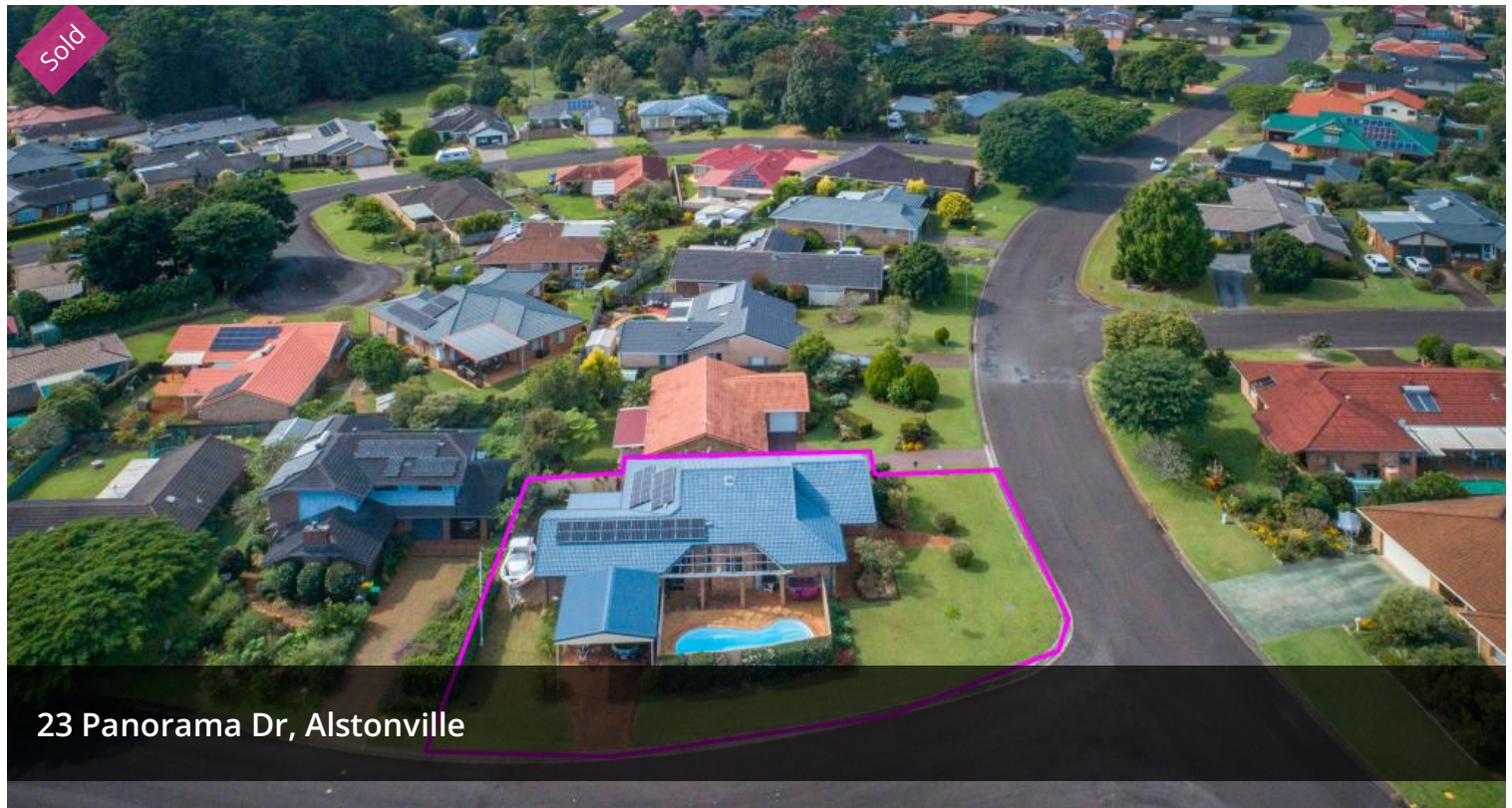
23 Panorama Dr, Alstonville