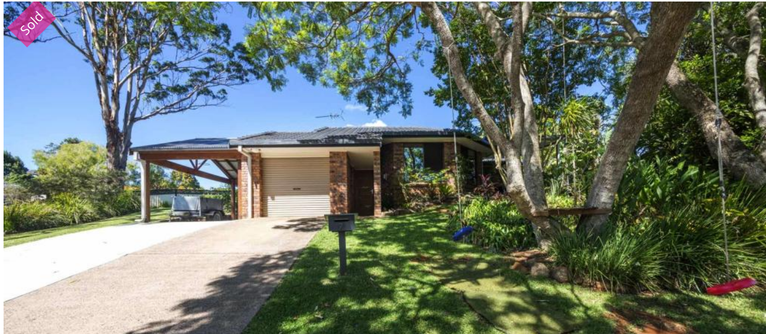
7 Cerreto Circuit, Wollongbar