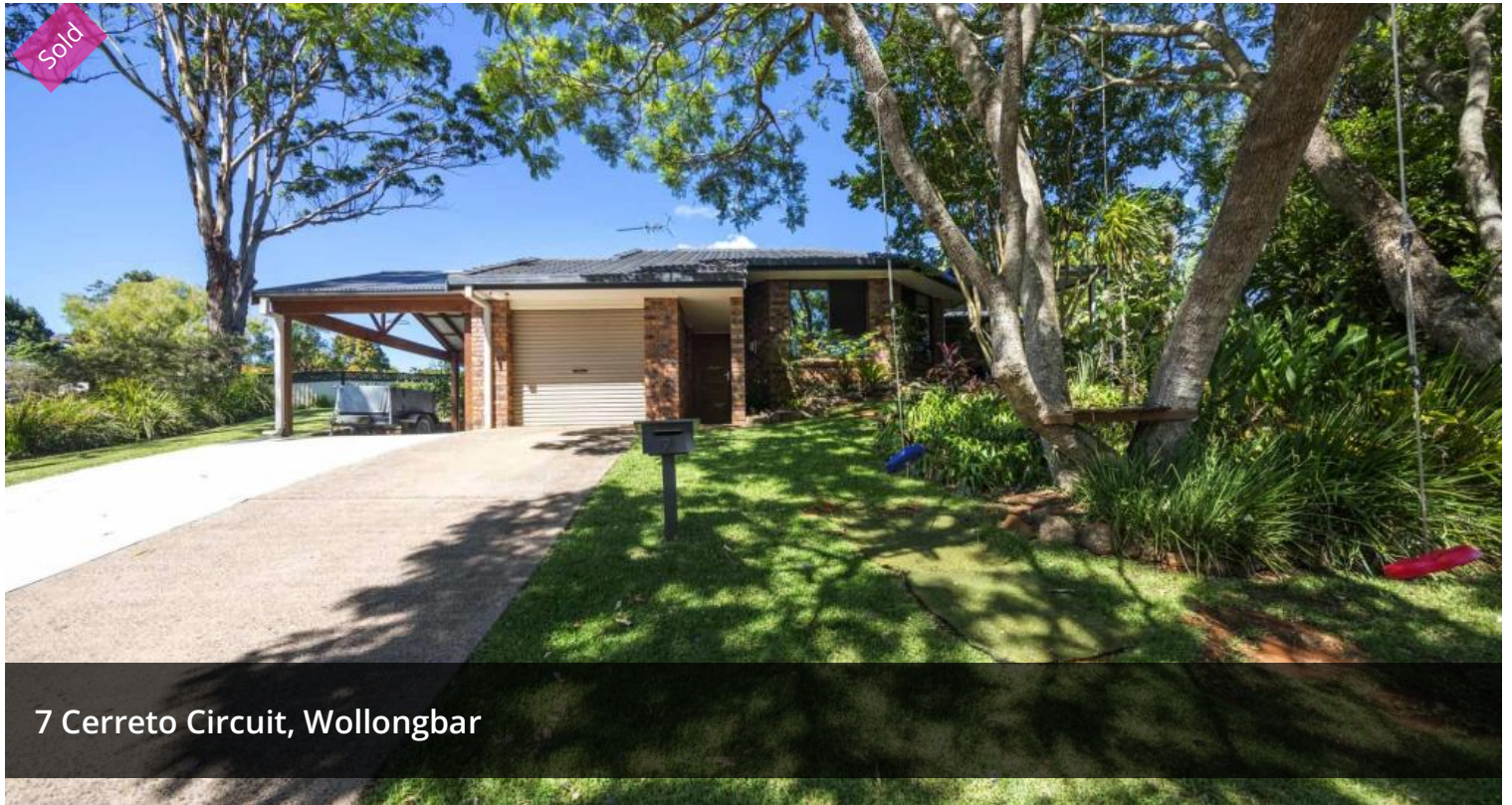
7 Cerreto Circuit, Wollongbar