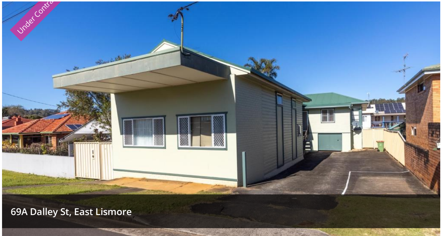
69A Dalley St, East Lismore