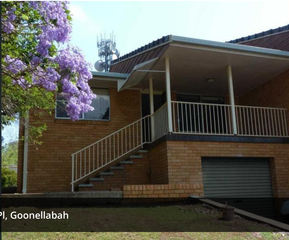
Unit 1, 4 Luke Pl, Goonellabah