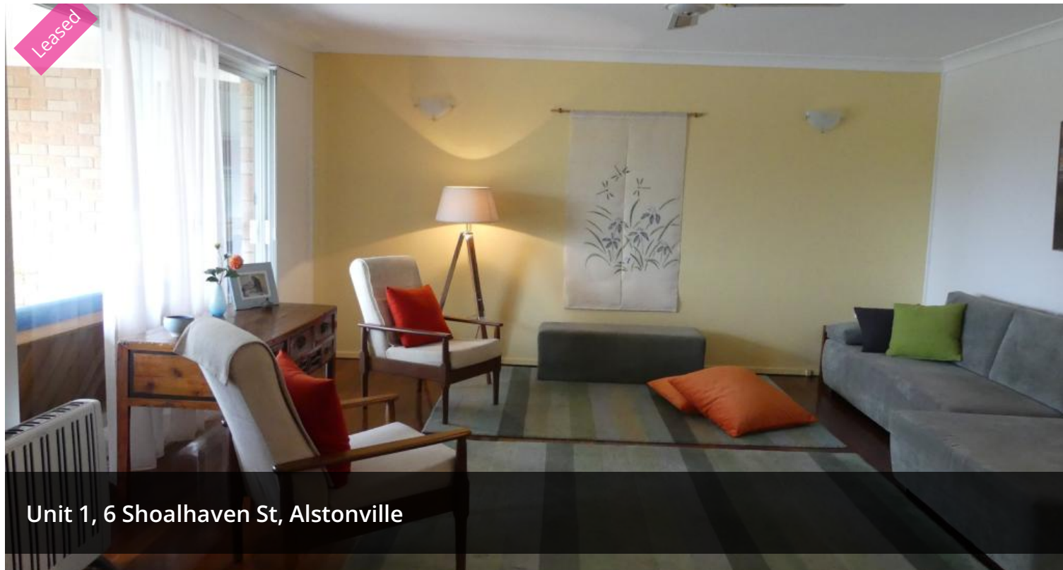
Unit 1, 6 Shoalhaven St, Alstonville