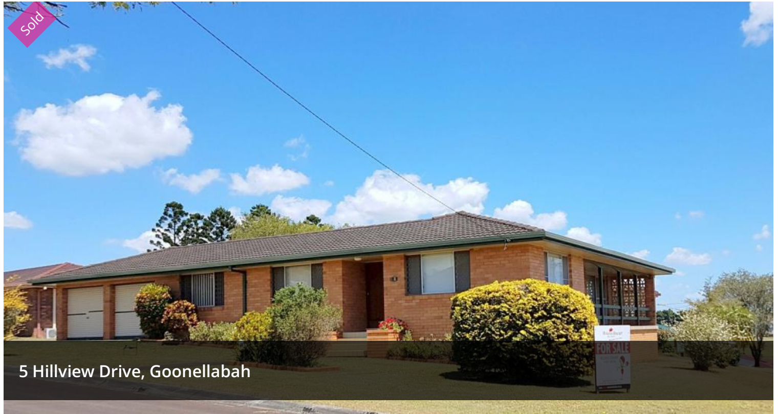
5 Hillview Drive, Goonellabah