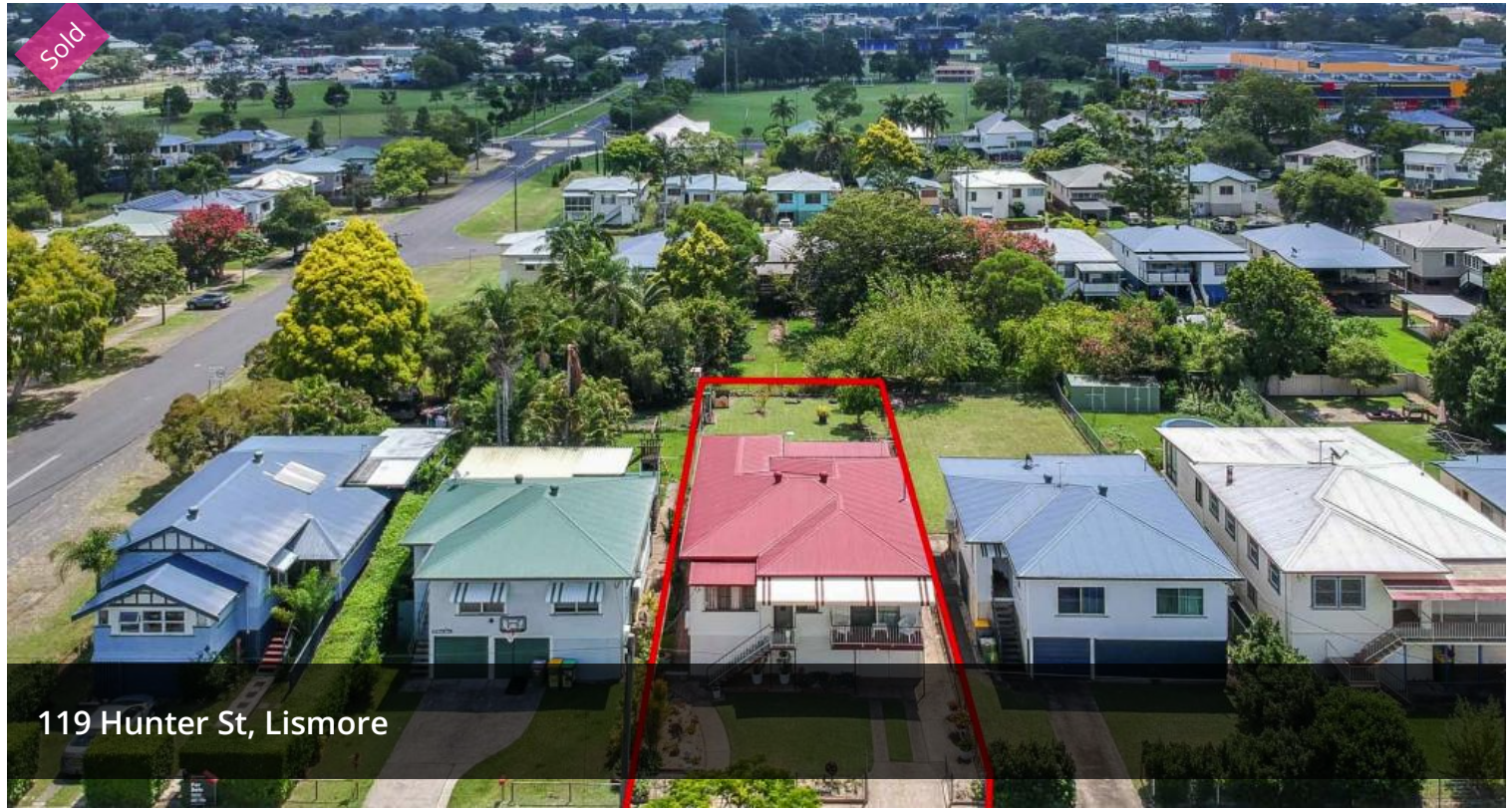
119 Hunter St, Lismore