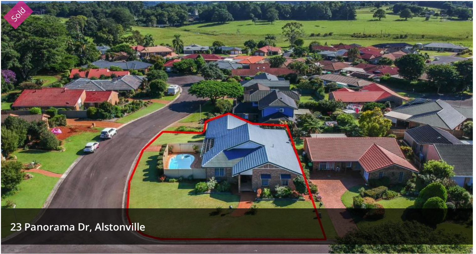
23 Panorama Dr, Alstonville