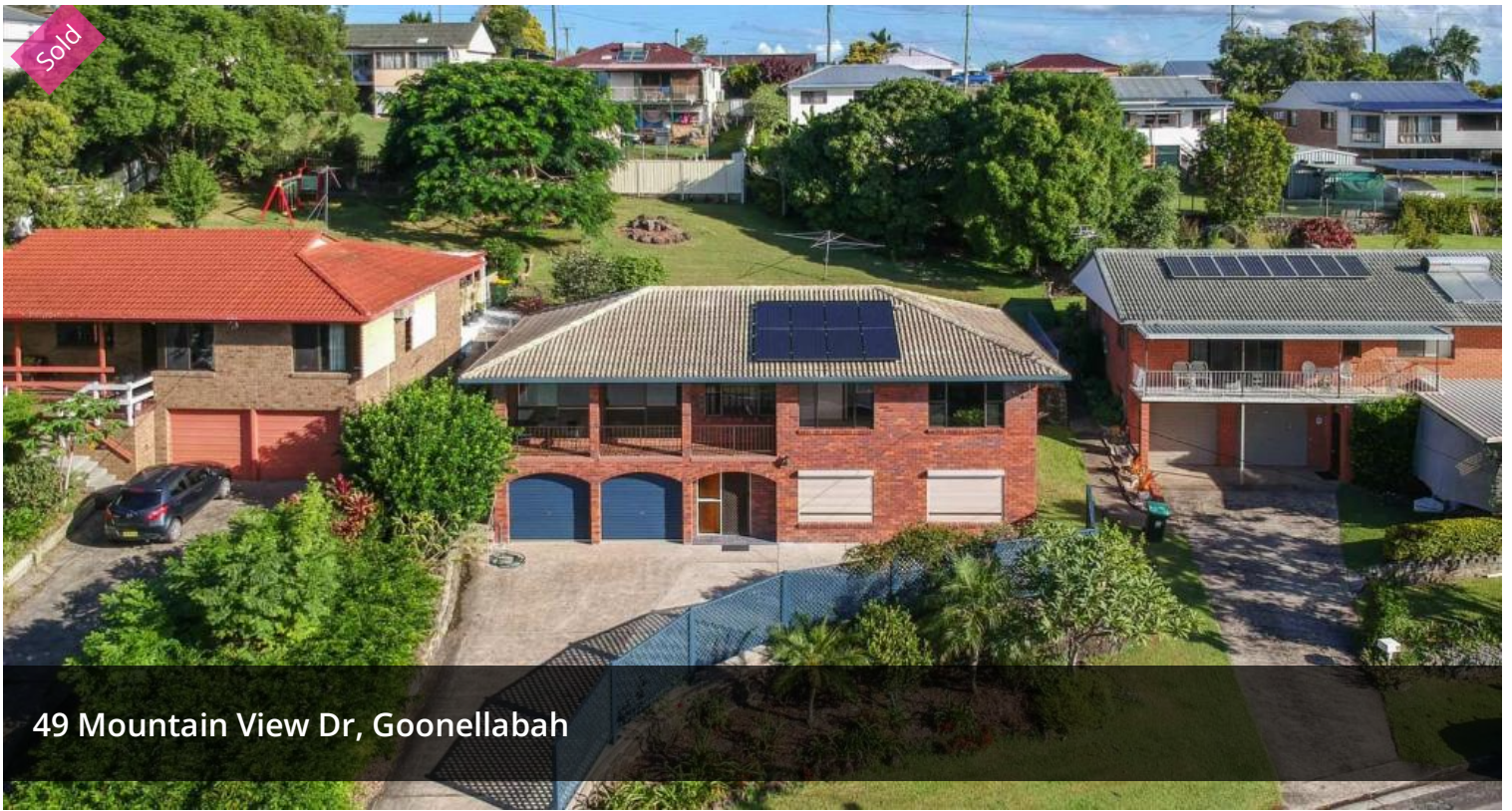
49 Mountain View Dr, Goonellabah