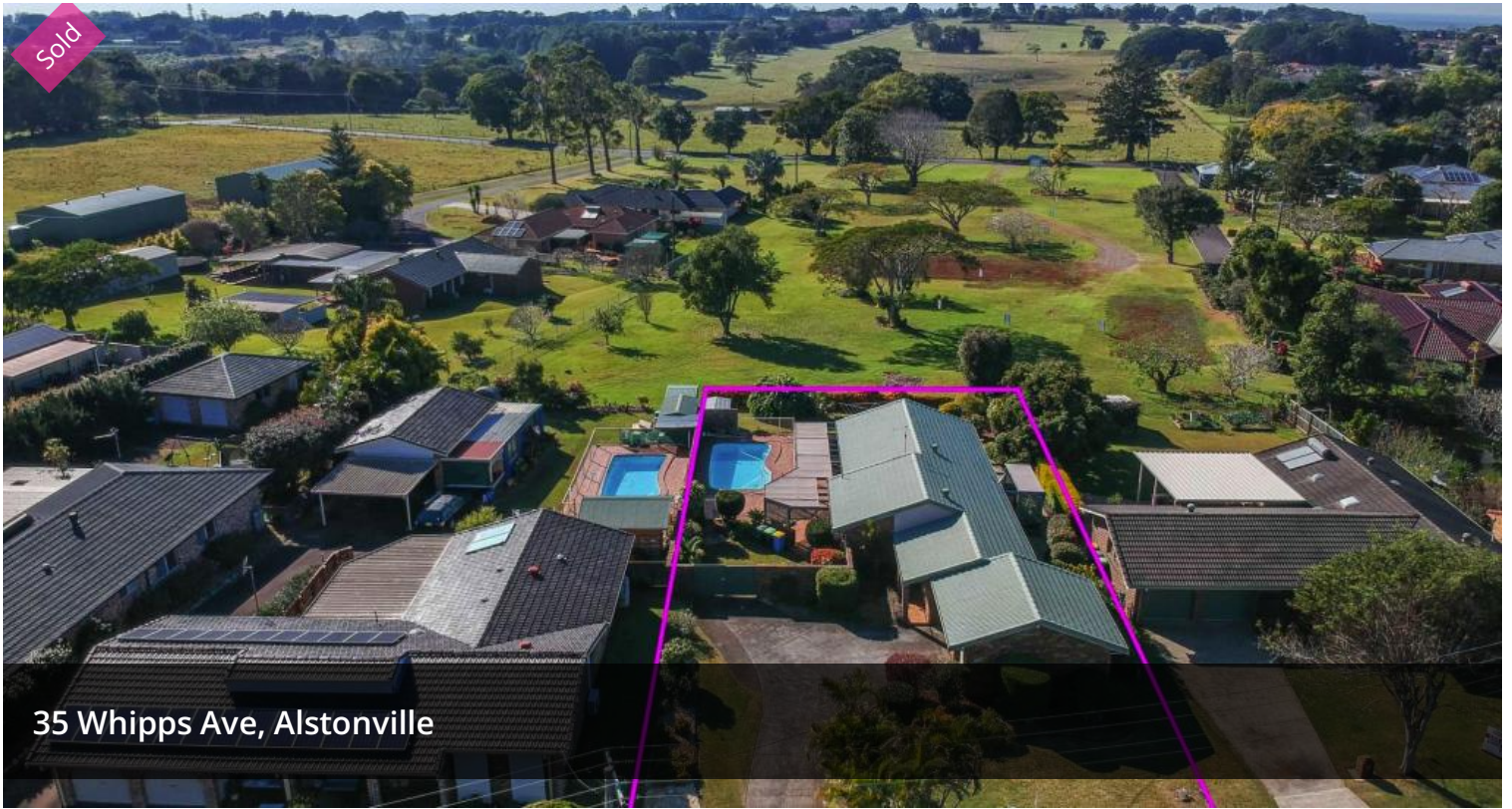
35 Whipps Ave, Alstonville