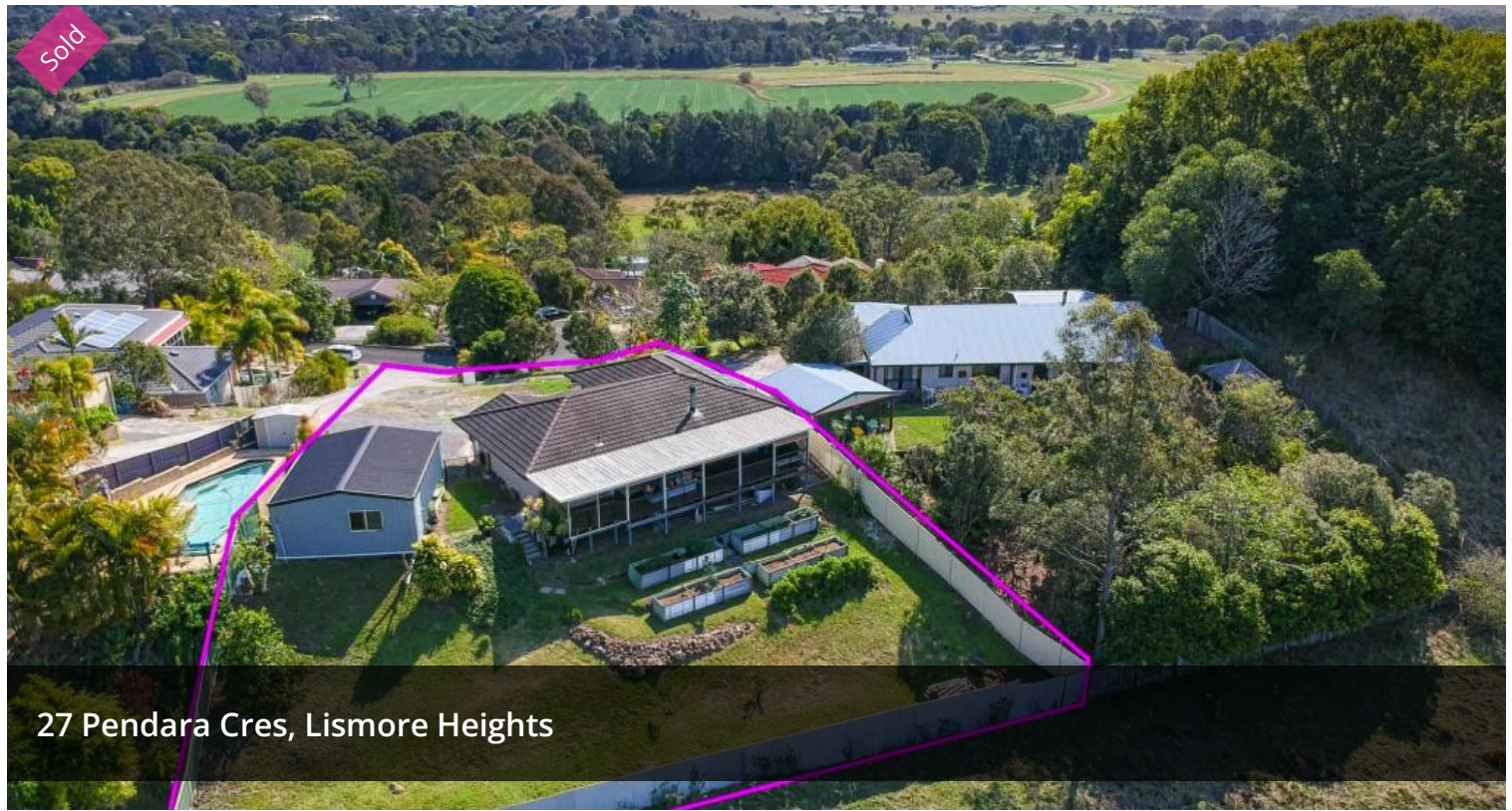
27 Pendara Cres, Lismore Heights