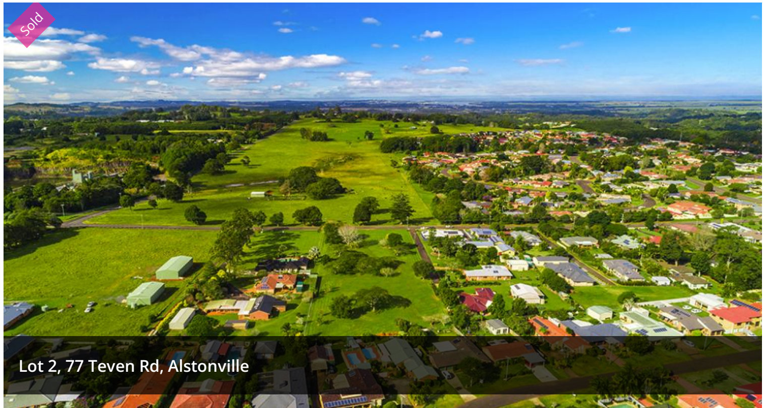
Lot 2, 77 Teven Rd, Alstonville