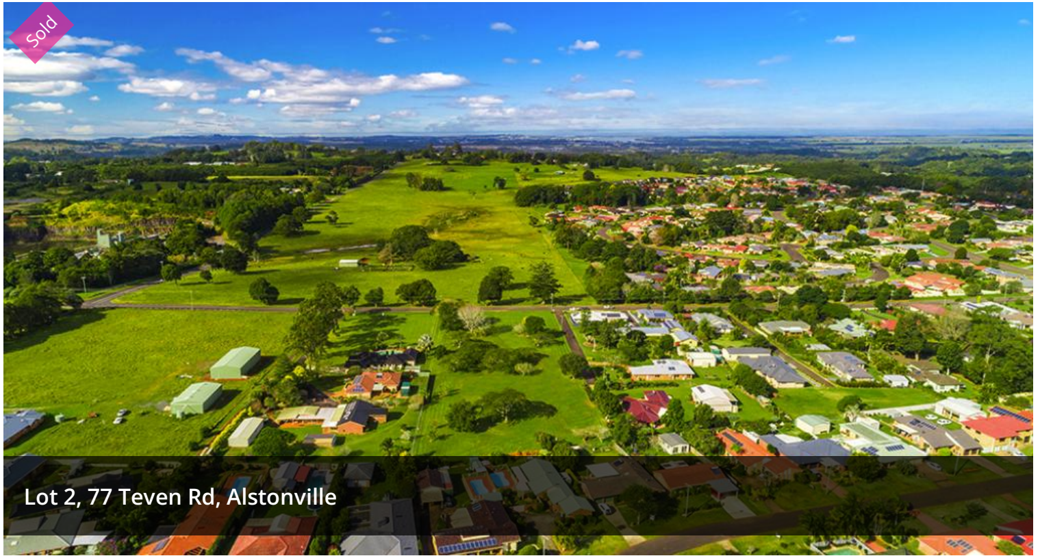
Lot 2, 77 Teven Rd, Alstonville