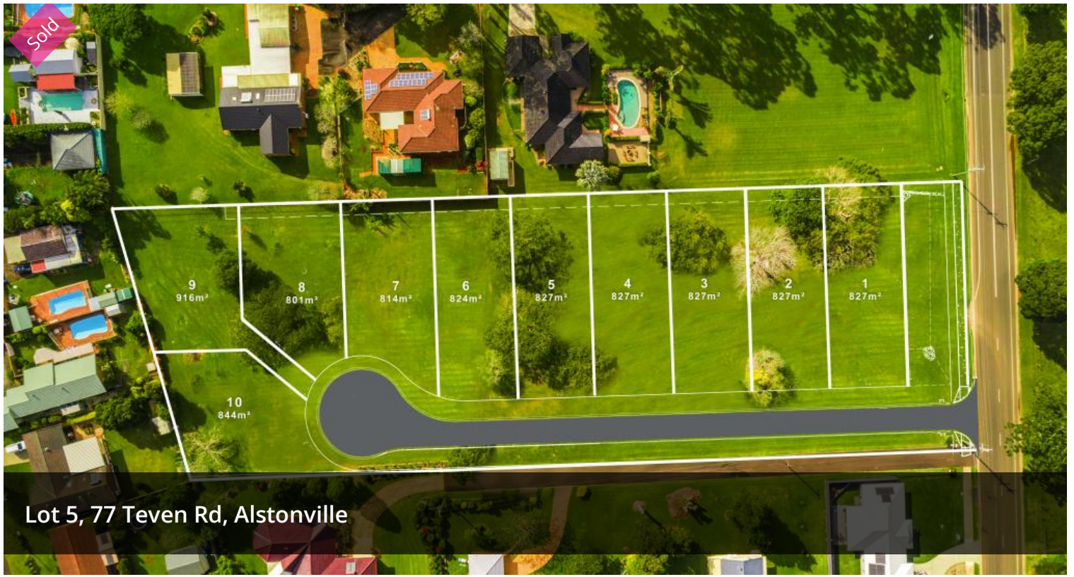
Lot 5, 77 Teven Rd, Alstonville