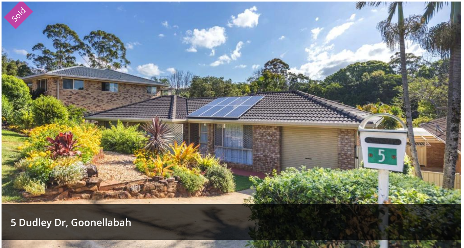
5 Dudley Dr, Goonellabah