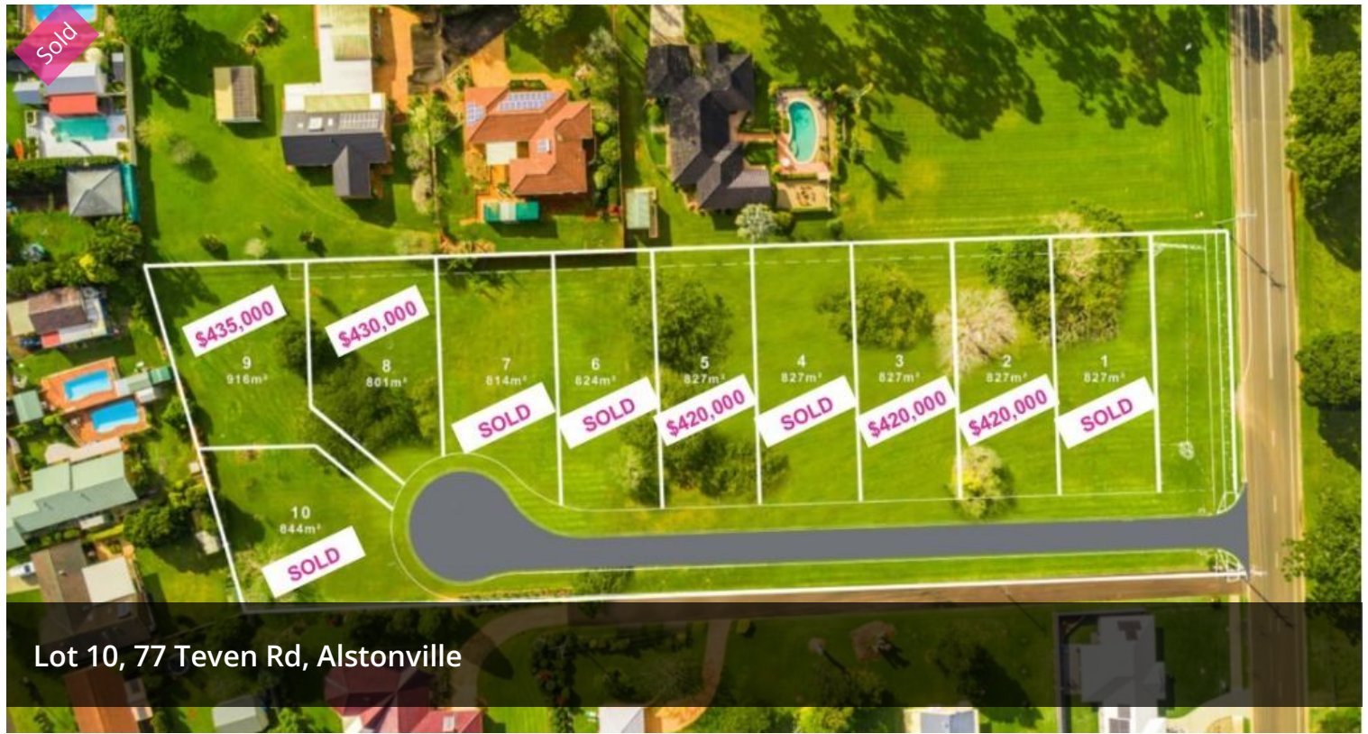
Lot 10, 77 Teven Rd, Alstonville